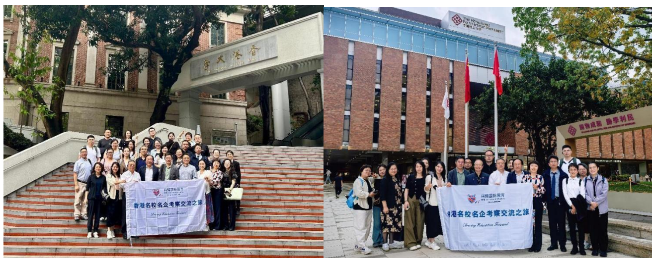
HOPE's tour to Hong Kong University and Hong Kong Polytechnic University

In Hong Kong, HOPE delegation visited Hong Kong University, Hong Kong Polytechnic University and Hong Kong Institute of Finance and Management. The delegates discussed the current market demand in mainland with admission officers from the HK institutions and know more about the characteristics of student recruitment.