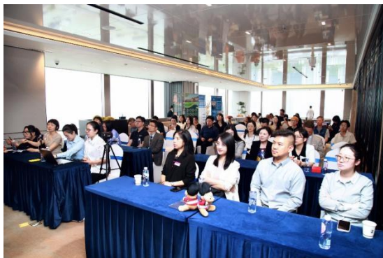
Audience on site

Don't take risk and advantage of rule. If the grades are not up to standard, please work hard. Be true, be honesty.