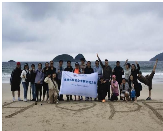
HOPE's tour in Hong Kong: M+ Visual Museum (left) and hiking at MacLehose Trail