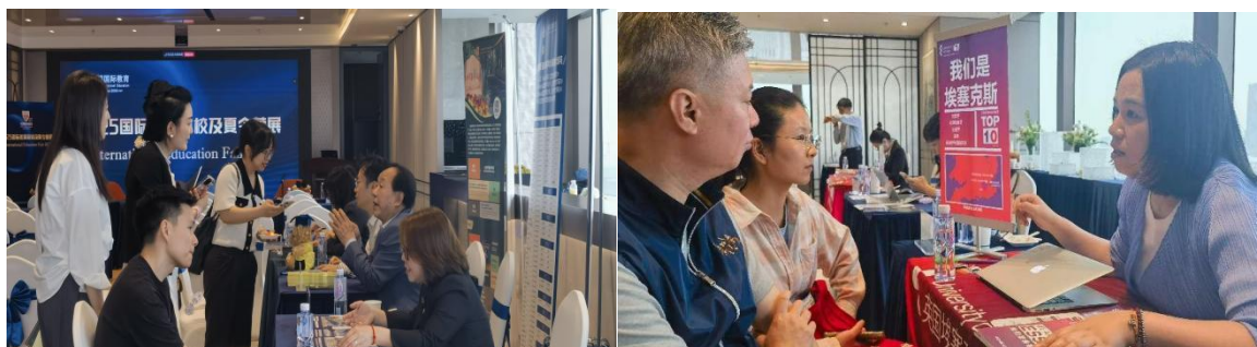
Enquiries at exhibition table

15 universities and schools from China, UK, Australia, Malaysia, and Switzerland, as well as the British Council were invited to this half-day event in Shanghai. About 30 families joined the fair. The number of participating families was lower than our expectation (We expect 50), however, the presented visitors showed different interest in different international education pathways and destination countries. The enquiries on UK, Australia were not as dominant as before, while institutions in Malaysia (University of Southampton Malaysia), international schools in Shanghai and joint venture institutions (University of Nottingham Ningbo) also gained popularity.