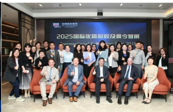
Group photo of exhibitors and HOPE staff

Here the suggestion from HOPE: In the face of the complex and ever-changing international