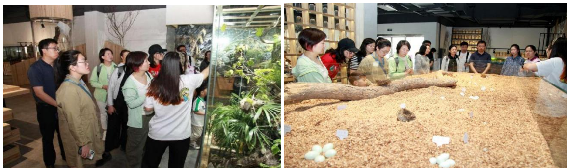
HOPE team & Tsinghua University IPCSL class visiting Linnaeus Laboratory in Wuyuan and listening to the professional guidance on biodiversity