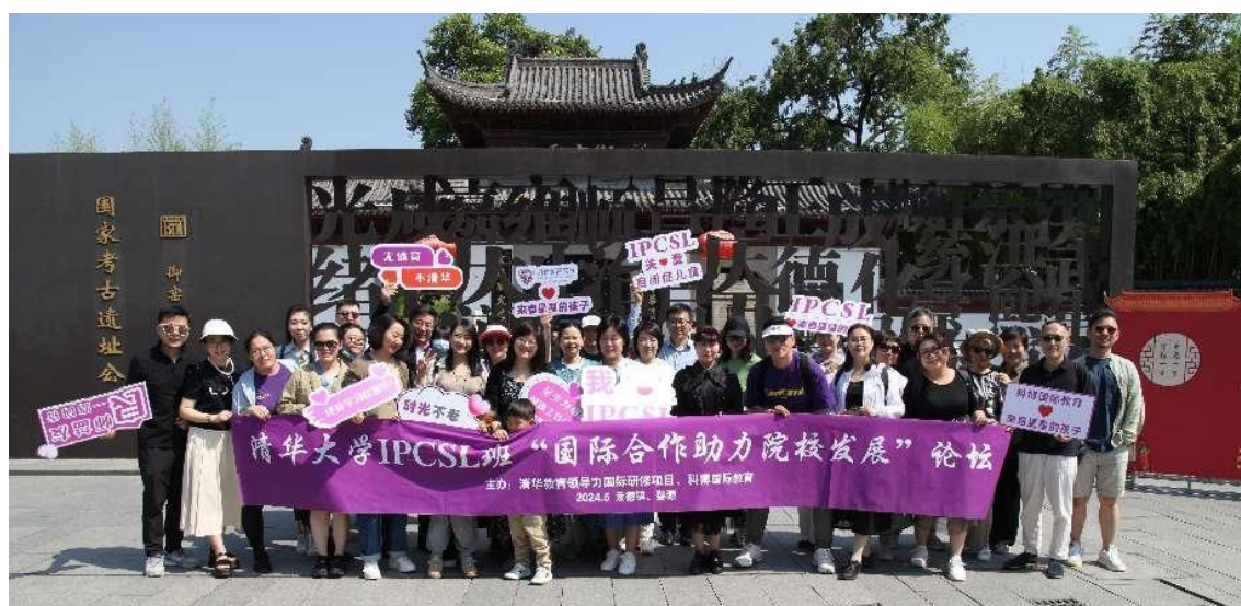
HOPE team & Tsinghua University IPCSL class visiting Imperial Kiln Museum in Jingdezhen

International Professional Certificate for School Leaders (IPCSL) class, is jointly run by Tsinghua University and UCL for school leaders, particularly those from international schools, to improve their leadership skills. In order to promote the international collaboration between Chinese and overseas school and help the Chinese principals to understand the significance of international collaboration, HOPE International Education and IPCSL jointly organized the forum and the trip.