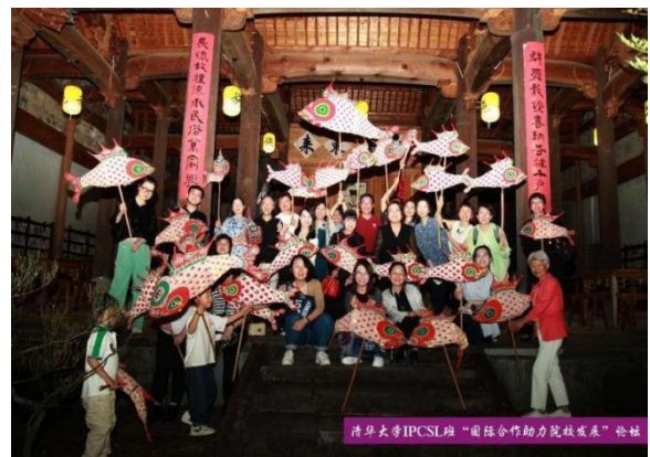
Night in Wuyuan with Fish lantern

HOPE team and guests have also watched live landscape performance ‘china’, telling the story of china in each dynasty in Chinese history. The participants also went to Wuyuan to appreciate the beauty of nature as well as its rich biodiversity. This trip to Jingdezhen and Wuyuan has been a great success. One of the guest said ‘it is lovely to see such a cohesive team as HOPE! I am looking forward to joining HOPE next event!’