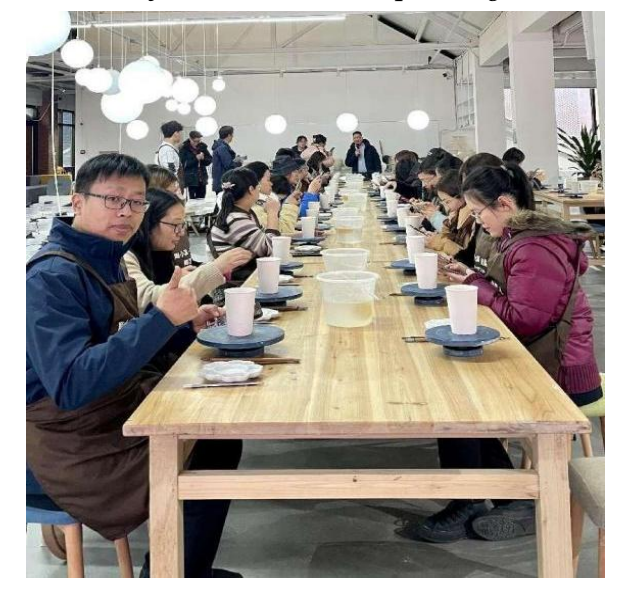
Another hands-on charity activity during the forum was ceramic cup painting with the theme: 'love and hope'. The finished cups will be donated to autism children in Shanghai and Ningbo!