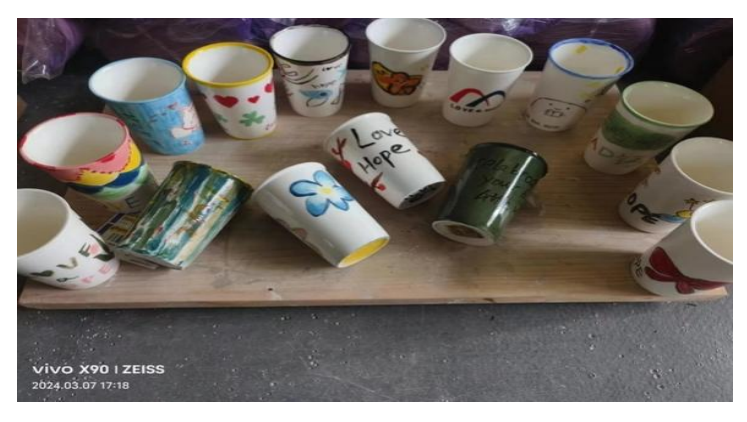
Some of the finished works