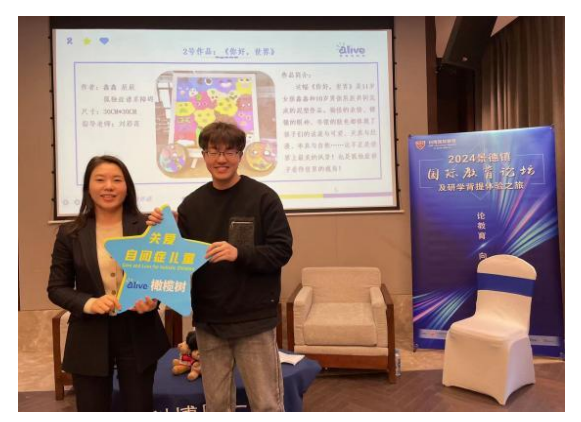
Some winners of the auction sale for paintings from autistic children