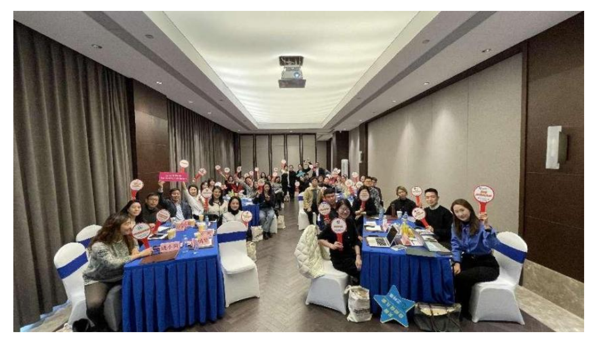
The climax of the conference, the charity auction sales of autistic children's painting