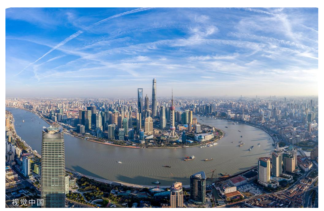
A view of the Huangpu River in Shanghai.

By Muhammad Humayun Asghar | chinadaily.com.cn | Updated: 2024-02-19 16:13