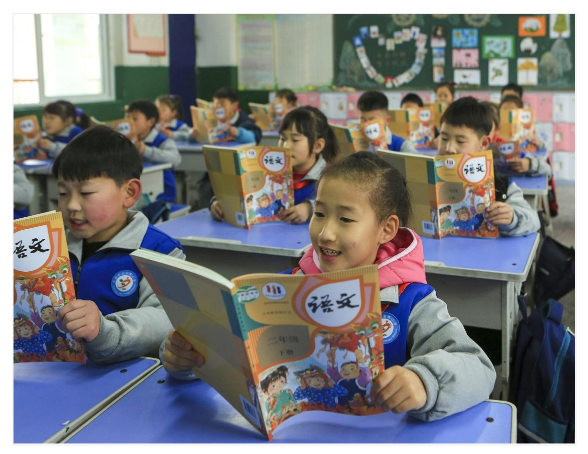
Students take a Chinese class at Wenchang Road Primary School in Jiyuan, Henan province, Feb 26, 2024.

By Zhao Yimeng | chinadaily.com.cn | Updated: 2024-03-01 11:30