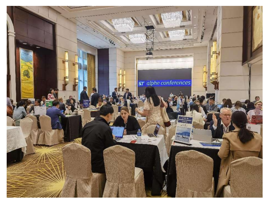
St Alphe HK joined by over 130 schools from the globe and 200+ agents

For the first time after pandemic, HOPE attended St. Alphe Conference focusing on secondary education held in HK from 22-23 February. Over 130 schools from the globe and over 200 agents in Asia joined this two-day event.