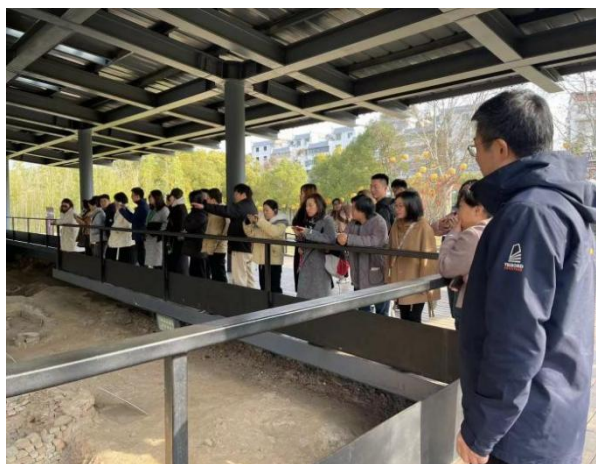
Visiting Imperial Kiln Museum and the archaeological site

The whole trip in Jingdezheng ended with happiness and high comments from the participants.