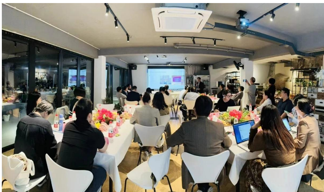
30 principals and directors from international schools and universities across China gathered at HOPE's night forum in Xiapu.

About 30 international schools' principals, directors and officers of international offices of Chinese universities, joined HOPE's Education Forum on How International Collaboration can Empower Institution's Development from 13-15 October in Xiapu, a fishing town in South-East China's Fujian Province famous for its beautiful scenery of sunrise and sunset. Organized by HOPE and sponsored by the British Council, Newcastle University, Loughborough University and Cambridge School of Visual and Performing Arts, the Forum also coincided with the Charity Photography Contest and auction sale for autistic children arranged by HOPE and its partner autistic children's rehabilitation centres from Shanghai, Hangzhou, Nanjing and Huaian.