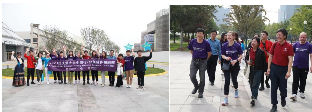
Charity walk along the West Bund in Shanghai with HOPE staff, Loughborough University alumni, representatives from university's industry partners.

After the visit to the rehabilitation centre, Loughborough delegation enjoyed a charity walk with its alumni, representatives from HOPE, Clove Autistic Children's Rehabilitation Centre and its industrial partners along the waterfront of the city's famous West Bund, an artistic area with many galleries, art museums. It is with the purpose that the event can further promote the awareness of the people to care and support the autistic children and their families.