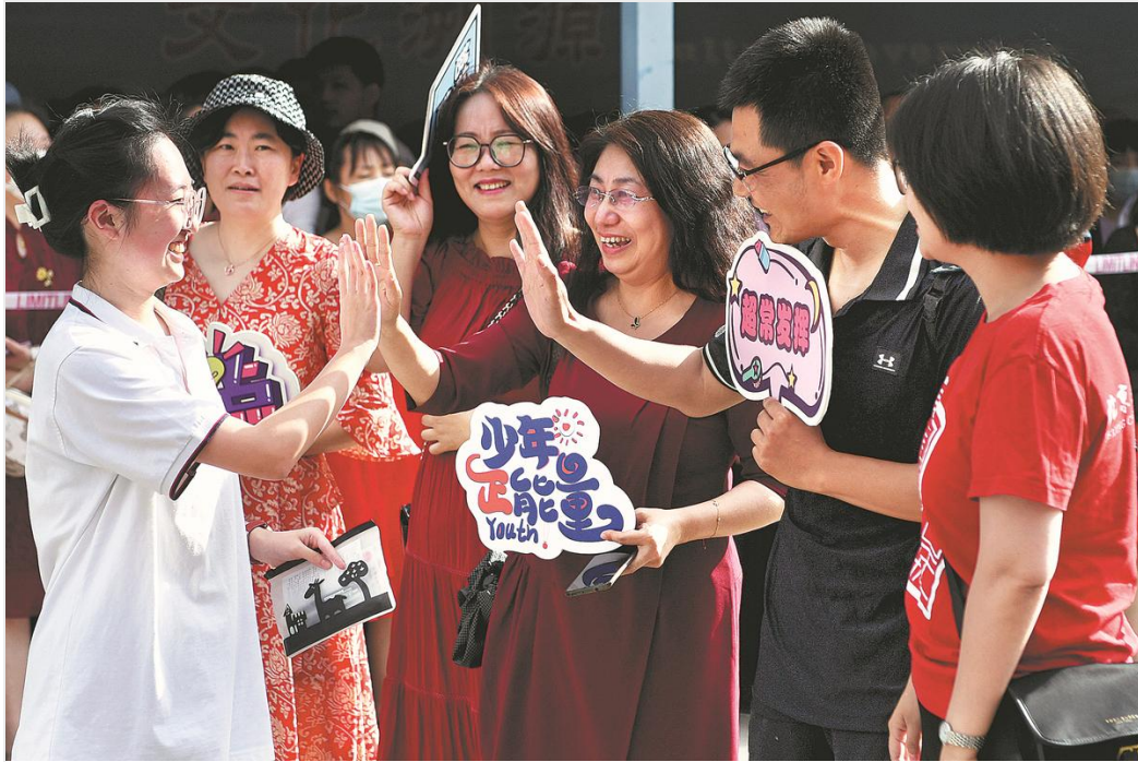
Teachers cheer on a student who is about to take the gaokao, or national college entrance exam, at Beijing Chenjinglun High School on Wednesday, the first day of the exam.