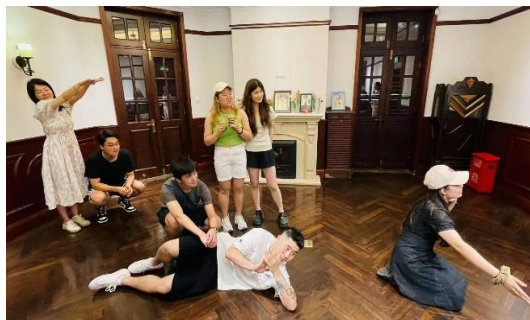
Improvised performance from students

Fifteen HOPE alumni from top UK universities, such as Cambridge, Bristol, UCL, and Glasgow were invited to the event. Besides, some students from HOPE's partnership university, Shanghai University of Sports, Shanghai International Studies University, Shanghai Dianji University also attended this half day party. The event utilized some best improvisation games for icebreakers, and guided students to acquire the wisdom of "Yes, and", the essence of any improvised acting performance ---- it required an individual to fully embrace what was given to them and create from spontaneity in the NOW moment. The students co-operated in teams and put on the best improvisation show!