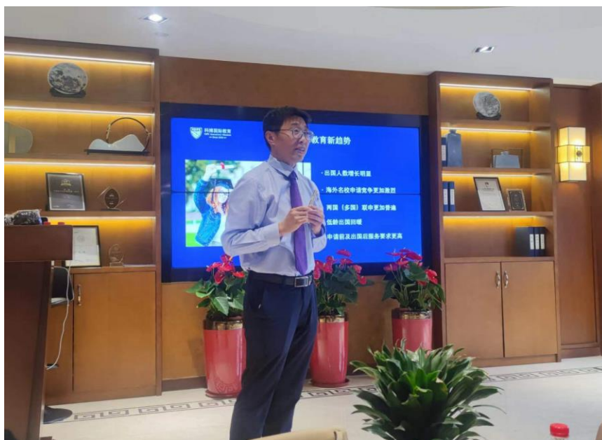
International Education Workshop: Changzhou Stop