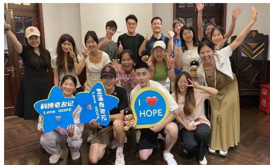
HOPE alumni group photo after the gathering

The event invoked profound creativity, imagination and teamwork from the students, which enabled them to temporarily let go of stress from this "Rat Race" environment, and opened up their trust and innocence to connect, play, and fully express themselves as unique individuals.