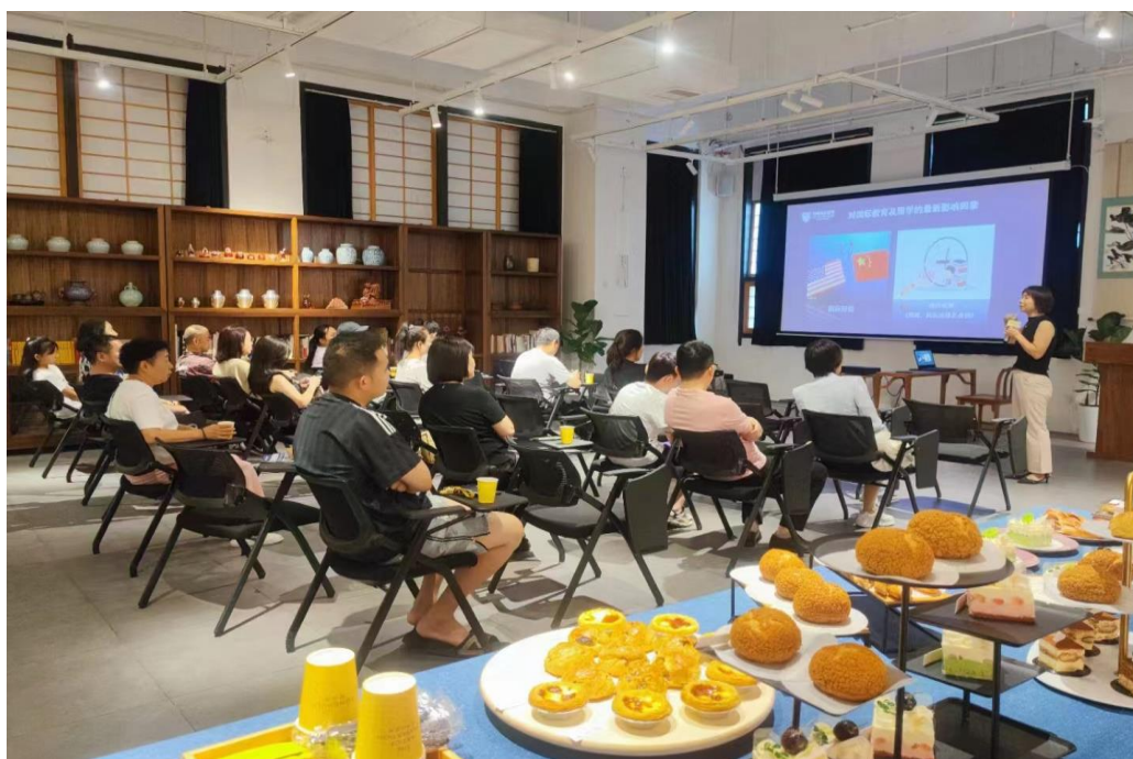
International Education Workshop: Zhengzhou Stop