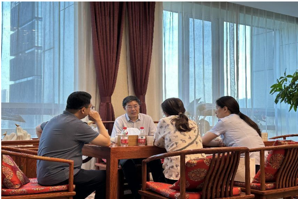
HOPE counsel parents for international education in Taiyuan, Shanxi Province at the invitation of Industrial Bank.