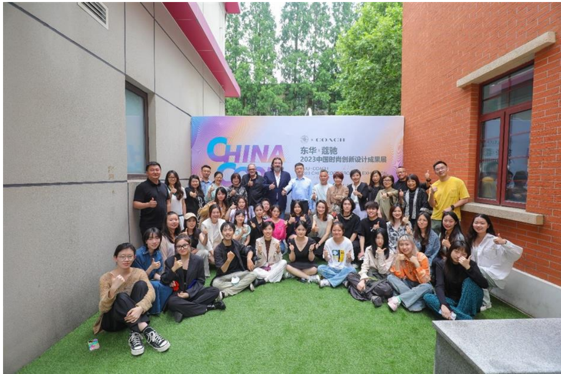
Participants of the "China Cool" program pose for a photo group.