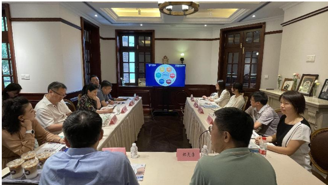
Senior management team of HOPE and Jinjiang Travel Group met at a historic cafe

The newly opened cafe after refurbishment witnessed a heated discussion on the areas both companies like to deepen the cooperation. The partnership of the two enterprises started 6 years ago when Jinjiang provided international travel service for HOPE's summer and winter camps to the UK, US and Australia.