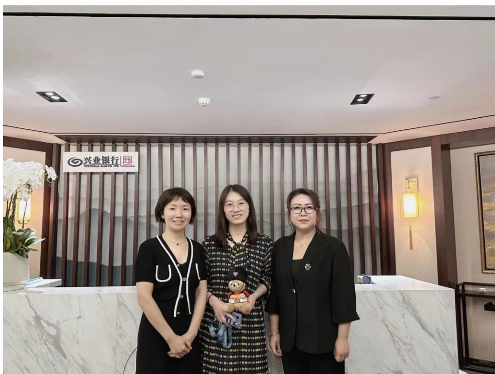
International Education Workshop: Nanjing Stop