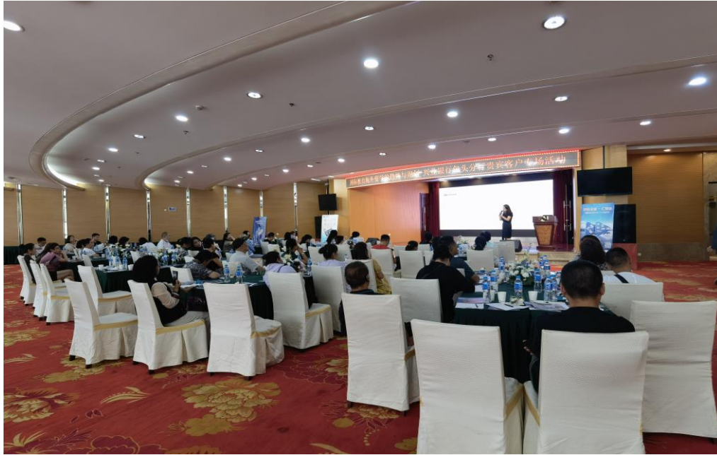
HOPE gave a presentation to 70 VIP clients of Industrial Bank at Baotou, Inner Mongolia on 8 th July