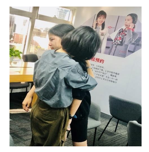
Hooli's talk on overseas student apartments