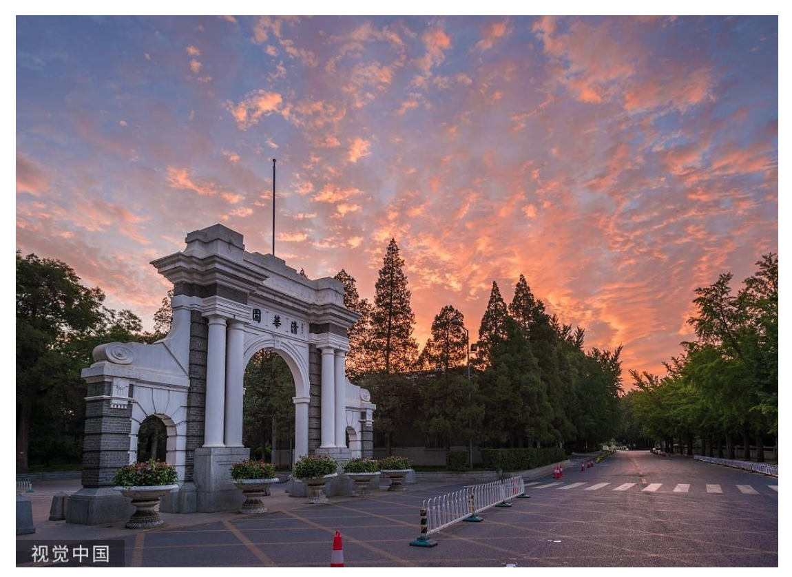
A view of Tsinghua University.

By Jonathan Powell in London | China Daily Global | Updated: 2023-05-18 00:00