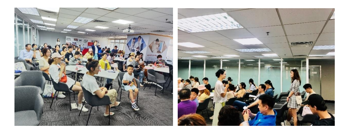
PBD moments in Shanghai

Apart from the presentations from HOPE Counsellors, a couple of guest speakers were also invited to share their insights on some other key areas of studying abroad,