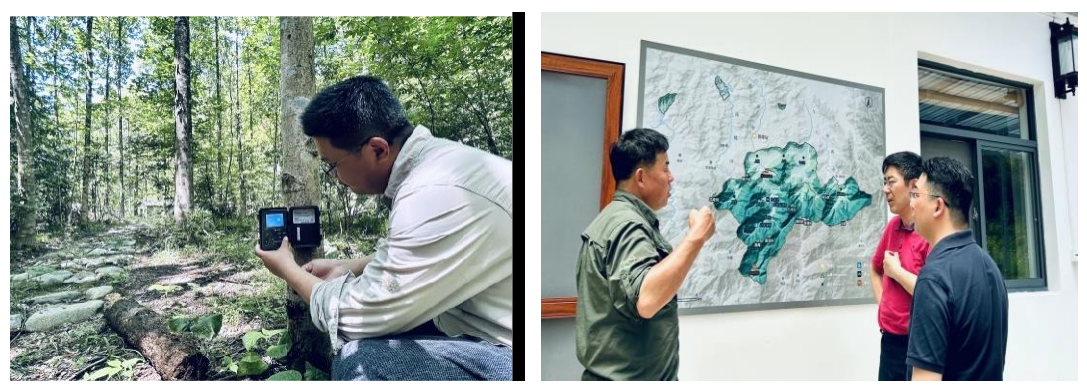
Exploring Jiulongshan Nature Reserve of Huangshan (Yellow Mountain)

In this changing market, we need to travel far to meet ourselves as well as clients demand!