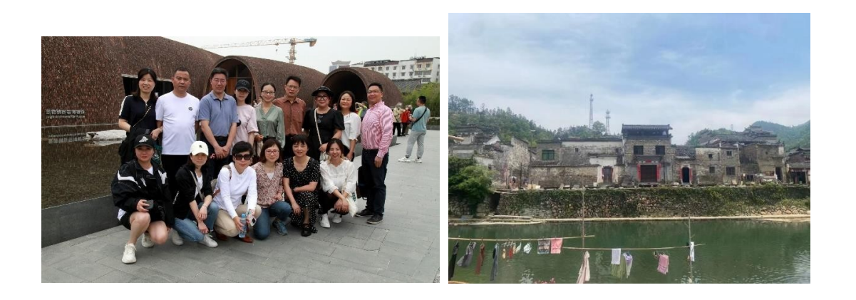
Group\ photo\ shoot\ outside\ the\ museum

Besides, the trip also provided a precious opportunity for parents to visit Jingdehen Imperial Kilm Museum, watch the live performance "china", and unwind in the local nature by the ancient town Yaoli as well.