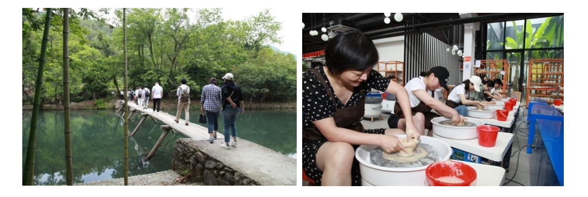
The trip to the natural reserve, Raonan