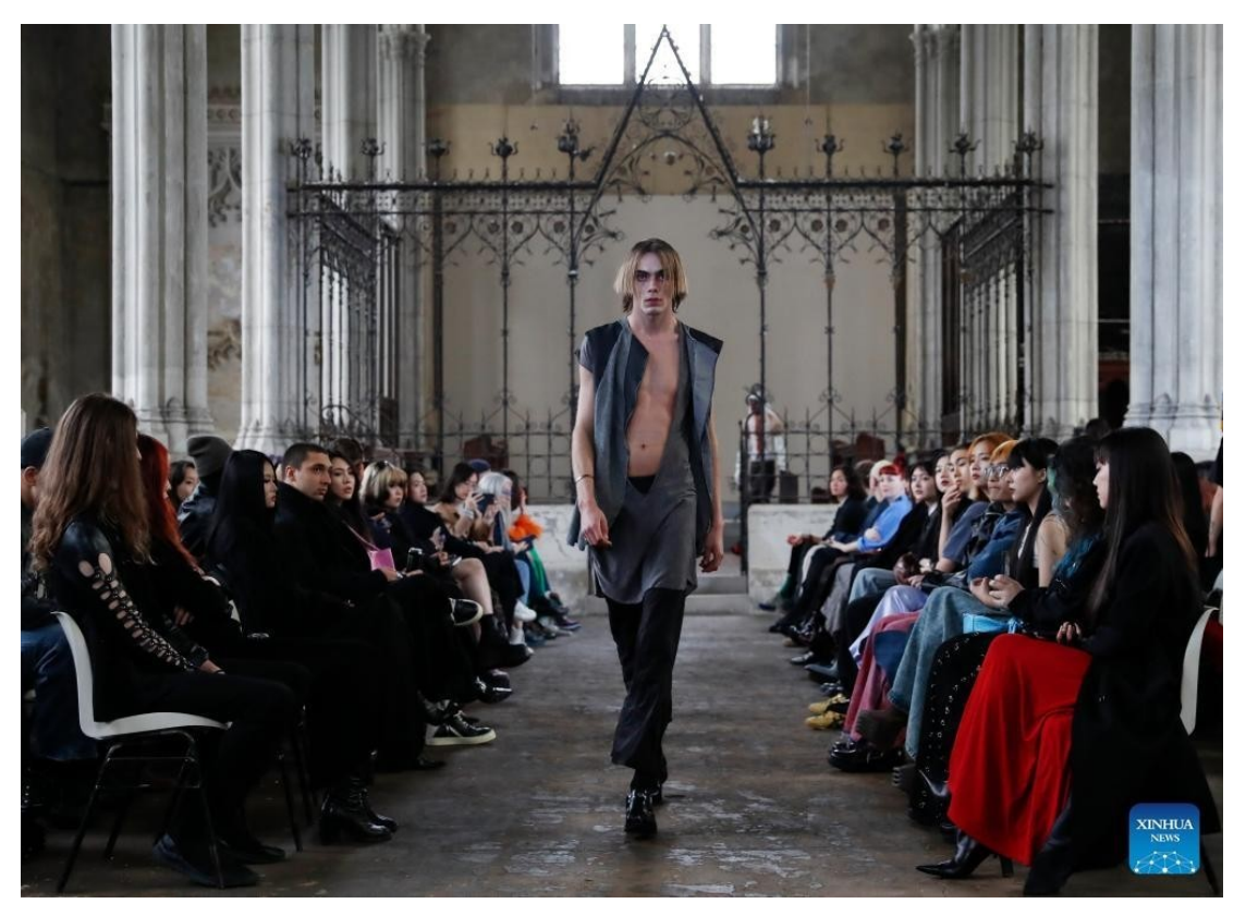
A model walks the runway at adarksecret 23SS catwalk show in London, Britain, May 13, 2023.

Updated: 2023-05-16 17:58