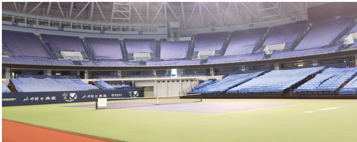
The main court where the Shanghai Master's finals were held.

We hope that HOPE can work with more of our partner universities including their career offices and alumni network to promote the universities in a more practical and creative way. At the same time, we hope that more students can benefit from the company visit for their future study as well as their career.