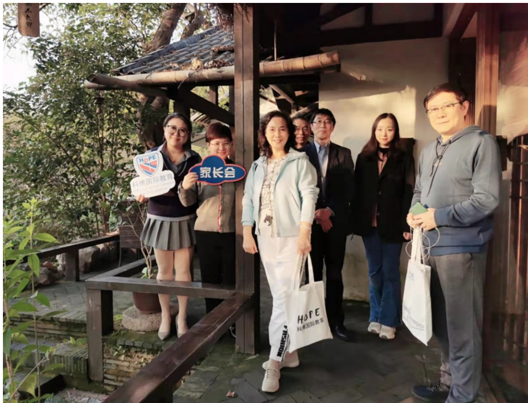
A consulting meeting with parents in Nanjing followed by an afternoon outing

In order to even better serve our clients, HOPE launched HOPE Parents Network (HPN) before the Chinese New Year after a careful survey among the parents. What are surveyed include some 15 questions including: what the parents care most during their kids' overseas study, what services are essential, what is the best way to communicate and share information between HOPE and parents as well as school and parents, what parents need to improve together with their kids, what kind of parents' events preferred. Also, a board of HPN committee was set up with 10 parents' representatives from Shanghai, Hangzhou and Nanjing.