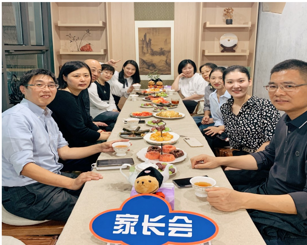
HOPE Parents meeting over an afternoon tea in Hangzhou

Why do HOPE and its clients rely on each other so much? The reasons are quite simple: once HOPE's client, forever HOPE's client! Whenever there is any need for support from the students and parents, HOPE is there for them. What's more, HOPE is continuously exploring the new services demanded by clients before, during and after the students' overseas study. Naturally in return, HOPE receives clients' recognition as well as clients' referrals.