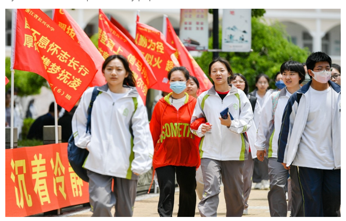
Students leave an exam site after their first test in Huzhou, East China's Zhejiang province, June 7, 2022.

By LUO WANGSHU | China Daily | Updated: 2022-06-09 10:03