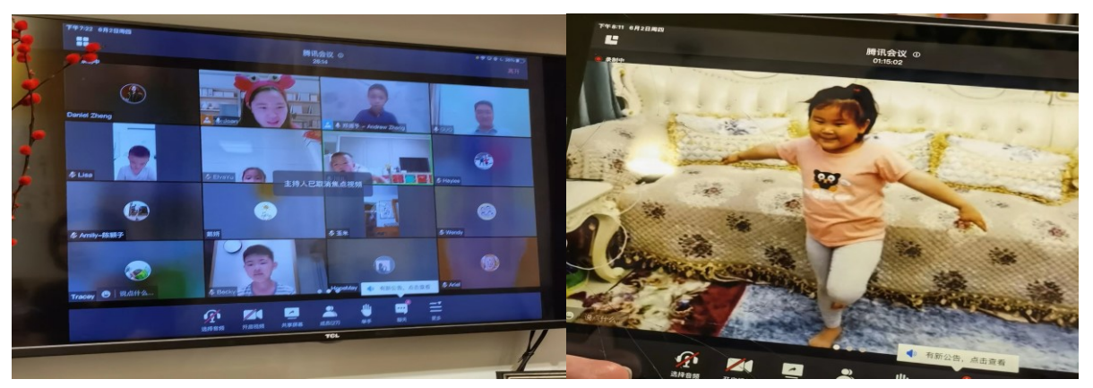
Online party for HOPE future stars

From piano to violin solo, from folk song and dancing to tongue twister in local dialect, from accordion to table tennis, 14 kids of HOPE staff from 6-month-old to 12-year-old staged a wonder performance at an online party celebrating the International Children's Day and Chinese Dragon Boat Festival on 2<sup>nd</sup> June.