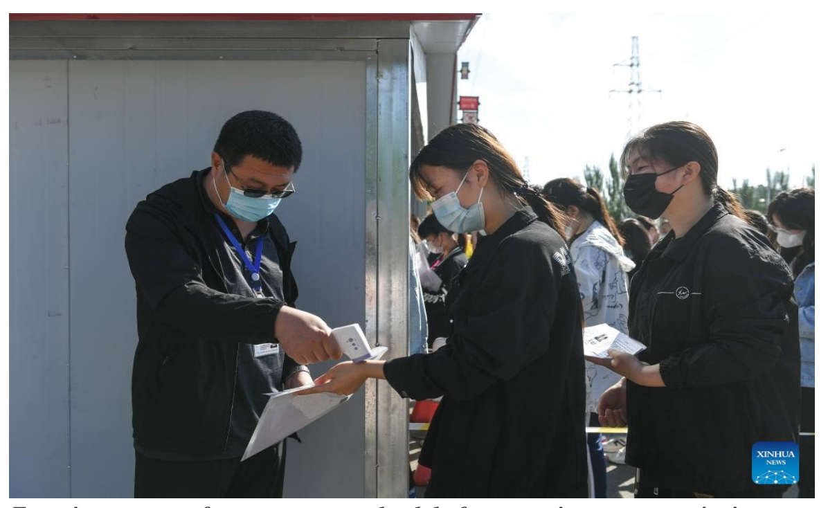
Examinees queue for temperature check before entering an exam site in Chifeng, North China's Inner Mongolia autonomous region, June 7, 2022.

BEIJING -- China has adopted tailored measures to ensure candidates take the 2022 national college entrance exam on schedule despite the impact of the latest COVID-19 resurgences.