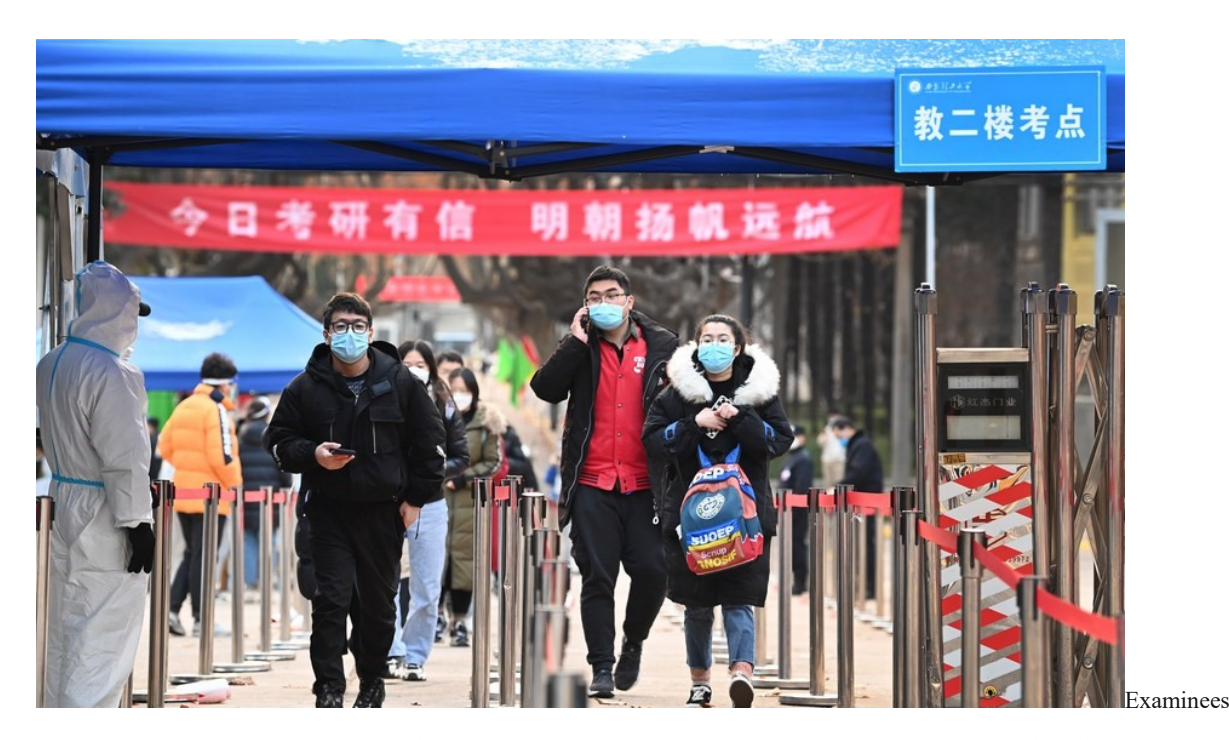
leave a venue of the postgraduate entrance exam at Xi'an University of Technology in Xi'an, Northwest China's Shaanxi province, Dec 26, 2021.