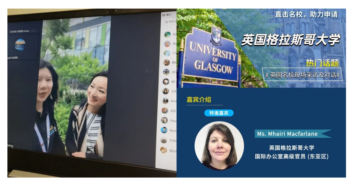
Live interview on campus, Southampton Poster for live event Uni of Glasgow