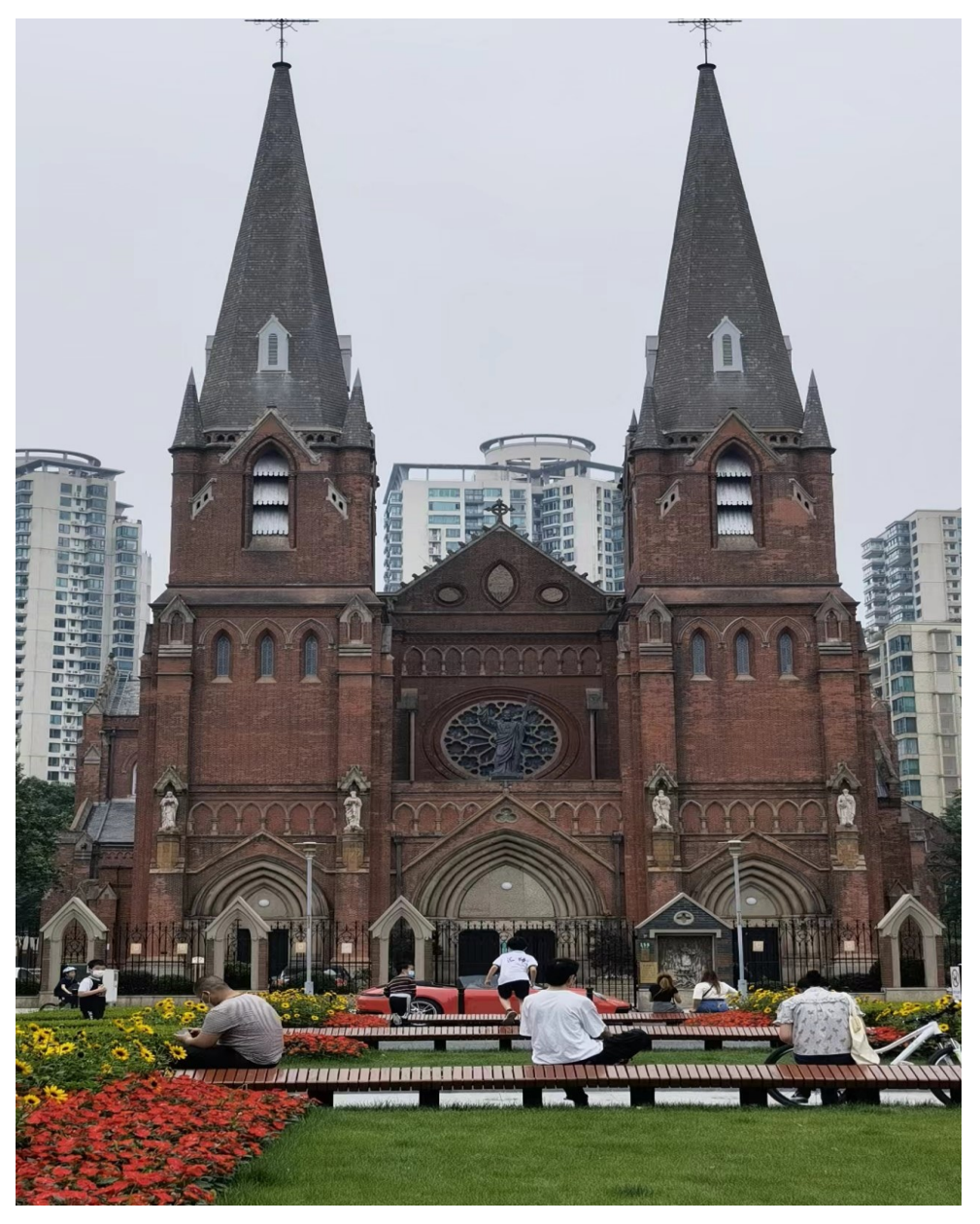
People in Shanghai enjoy the fresh air in front of the Cathedral in Xujiahui area near HOPE Shanghai City Centre Office

After almost 70 days' lockdown, Shanghai is finally back, not to the familiar past but to an uncertain future.