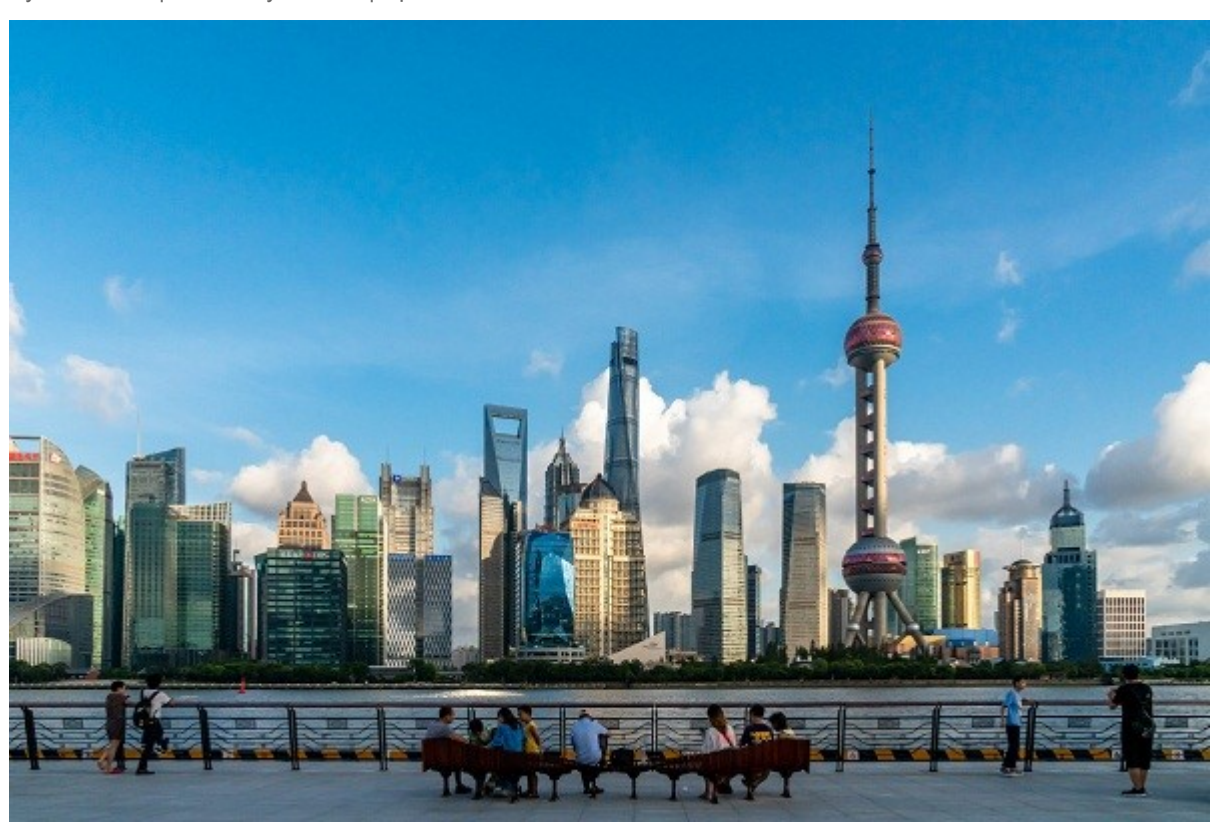
Lujiazui, Shanghai's financial center, forms a perfect backdrop to the Bund area.