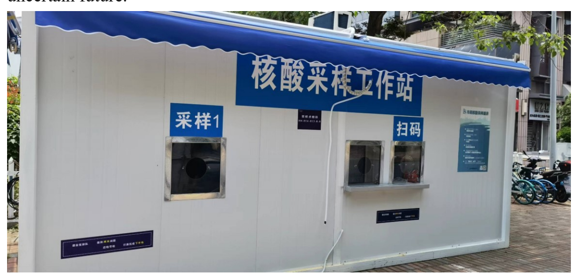
Covid test stations on street in Shanghai

From 1<sup>st</sup> June, but more from 6<sup>th</sup> June after Chinese' Dragon Boat Festival, most people in Shanghai were back to office, when they found the city, their work mode and even life style have not been exactly the same as before. The city is less crowded but cleaner; There are suddenly so many Covid Test Stations on streets; people are getting used to queuing for the Covid tests once every 3 days in order to get into office buildings, super markets and any indoor shops; restaurants are now open but only take-aways are allowed; People are advised to take the working necessities with them to home every day just in case. So many changes are happening and people are wondering if they are now back to normal or to an uncertain future.