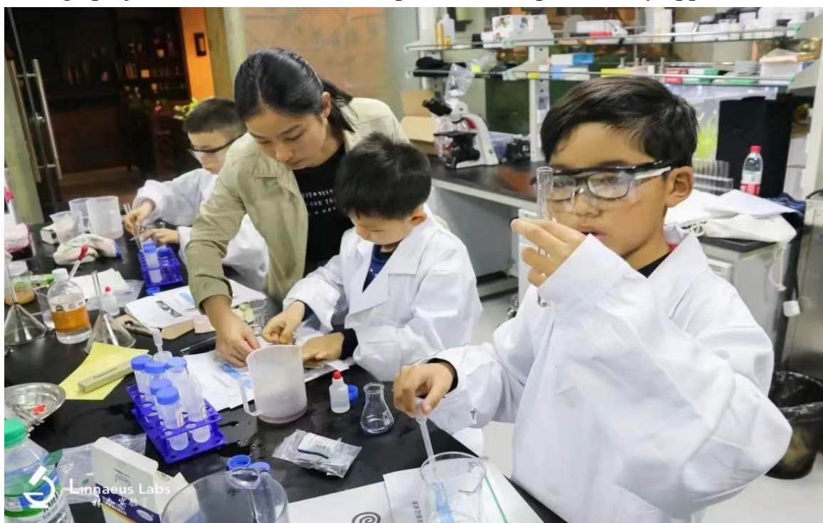
A lab-based study tour for young students at Wuyuan County, Jiangxi Province

Despite the government’s “double reduction” policy to control the tutoring and training for students, this summer still witnesses the increasingly high demand for various extra-curricular activities and online training particularly for “profile raising” projects due to the fierce competition for top university application.