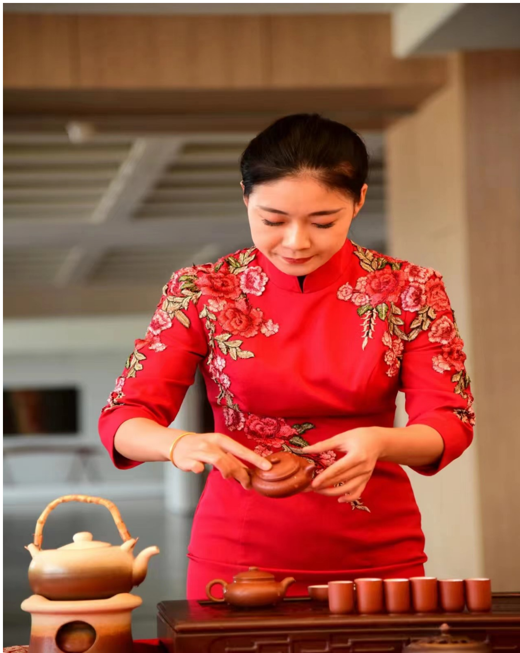
Wuyi Mountain is famous for its Rock Tea

The two-day event, usually host by HOPE in summer each year, offered an excellent opportunity for schools, universities, agents and the British Council to widely discuss the challenges and opportunities they are all facing and what the best solutions can be for all.