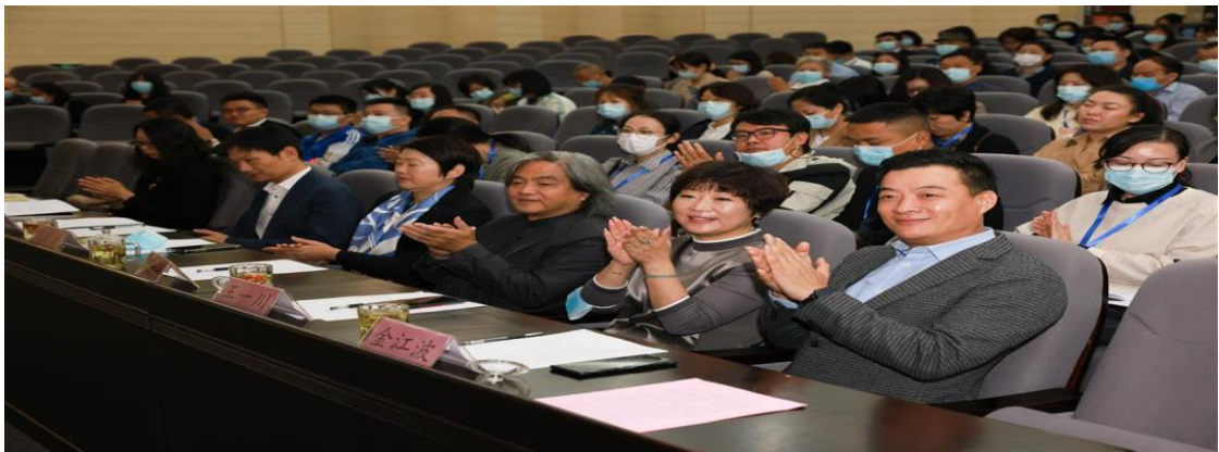
The opening session of the training course at the Baoshan International Folk Art Museum.

The market for cultural products developed by domestic museums has been developing rapidly in recent years. Online sales of creative merchandise has tripled between 2017 and 2019. Over 1.6 billion customers visit the official online stores of domestic museums every year, 1.5 times that of their offline visitors.