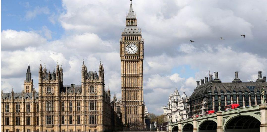
The Big Ben in central London, Britain.

SHANGHAI - The UK will showcase British food and drink as well as other products at the upcoming 3rd China International Import Expo (CIIE), meanwhile looking for more business opportunities by setting up a virtual exhibition hall.