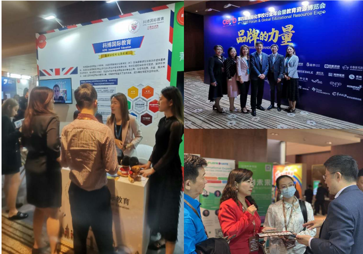
HOPE project team and exhibition stand at the 4 th CERB Forum & Global Education Resource Expo.

HOPE has already been working with around 10 international and bilingual schools in China, but more links are being set up. HOPE's workshop and exhibition stand at the 4 th CERB Forum & Global Education Resource Expo. held in Suzhou between 14-16 October attracted great attention from the participating international and bilingual schools across China. HOPE's professional team and rich UK institutional resources are highly applauded by the potential partners.