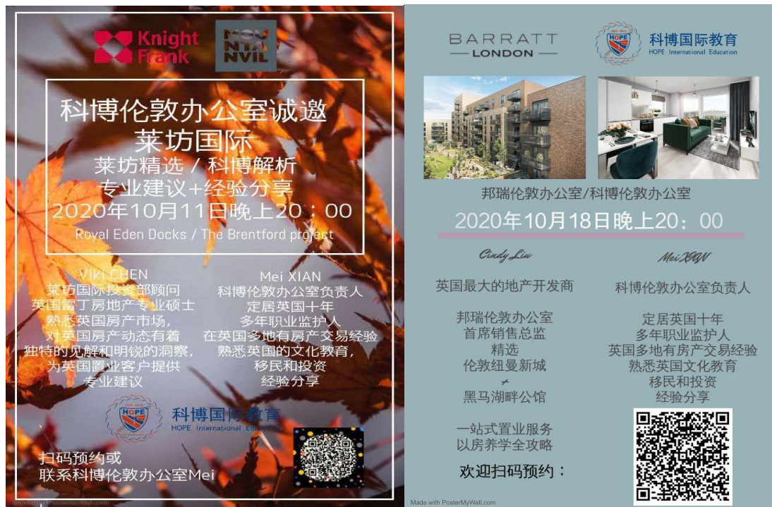
Posters for the two online seminars on How to invest the Property in London

Two online seminars on how to invest property in London were jointly organized by HOPE London office and KF and Barratt in the past 2 weeks with good number of audience joining, particularly those families whose kids are studying or planning to study in boarding schools in the UK.