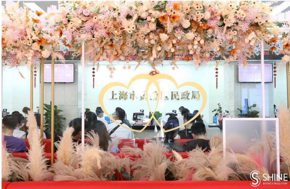
A view of the Huangpu District Marriage Registration Center on Wednesday.

More than 98,000 couples tied the knot in Shanghai last year, a decrease of 6 percent from a year earlier.